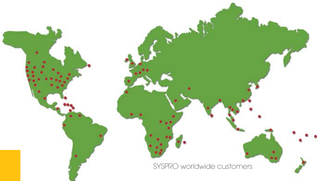
SYSPRO worldwide customers

"For the specific requirements of aerospace suppliers, SYSPRO does a lot more than the typical ERP/MRP system. It delivers the specific functionality that we need to control and manage our business, in order that we may improve our performance to customers and become better suppliers" Thermal Engineering