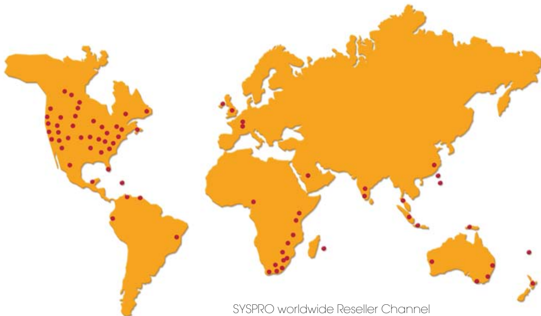
SYSPRO worldwide Reseller Channel

SYSPRO offers channel support through the 'SYSPRO Support Zone', a web-based front-end to the world of SYSPRO that delivers product upgrades, release notes and the important information channel partners need in order to stay current with SYSPRO affairs and news. In addition to providing information resources for technical personnel, SYSPRO is also actively involved in promoting product and industry knowledge within its representative sales force. The SYSPRO Sales Zone keeps sales and account executives informed about product capabilities and other types of information required to provide valuable information and consultation to customers.