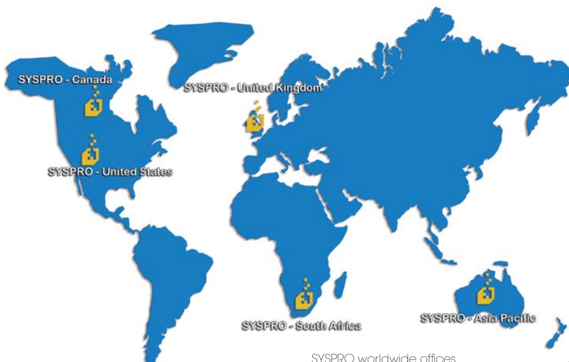
SYSPRO worldwide offices

By incorporating the annuity income module, it has assisted SYSPRO to ride the waves of various global influences on the IT industry, such as fluctuating market trends and resource availability to name a few.